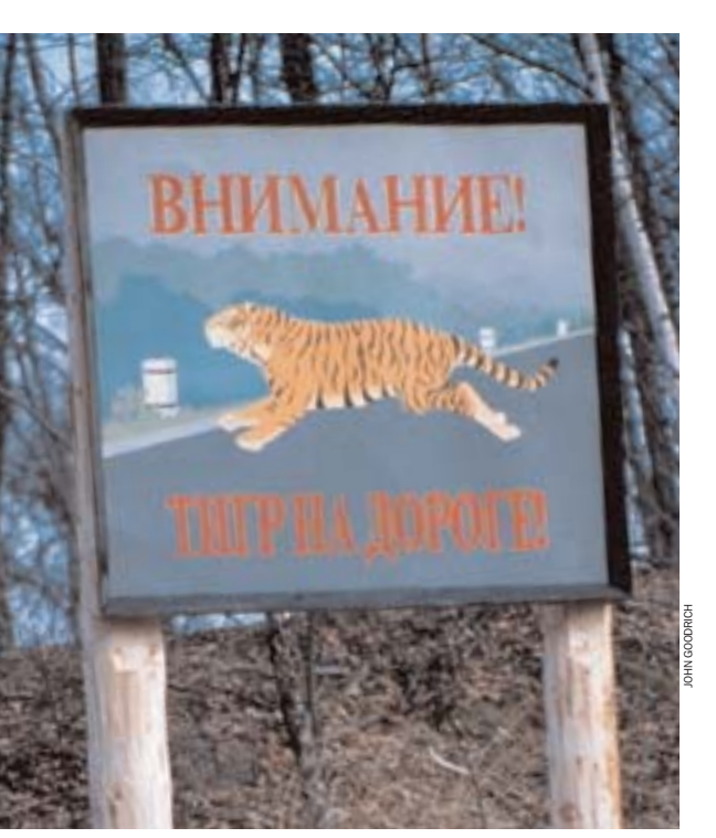
After Katya's cub was hit by a truck (above) on Khaunta Mi pass, a sign was erected that reads, "Attention! Tigers on the road." The sign (left) was designed by a Terney student who took part in a contest that was part of the Siberian Tiger Project's environmental education program.

to new territories. Remember, this is excellent tiger habitat and should be producing surplus tigers to populate other areas.