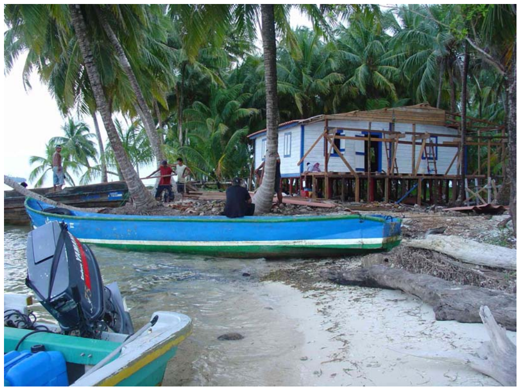
Photo 1. House built on the upper beach platform where hawksbills nest on Lime Cay, Pearl Cays, Nicaragua.