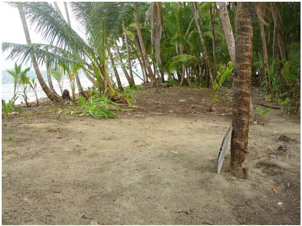
Photo 3. Ground cover vegetation of the upper beach platform was removed where hawksbills nest on Water Cay, Pearl Cays, Nicaragua.