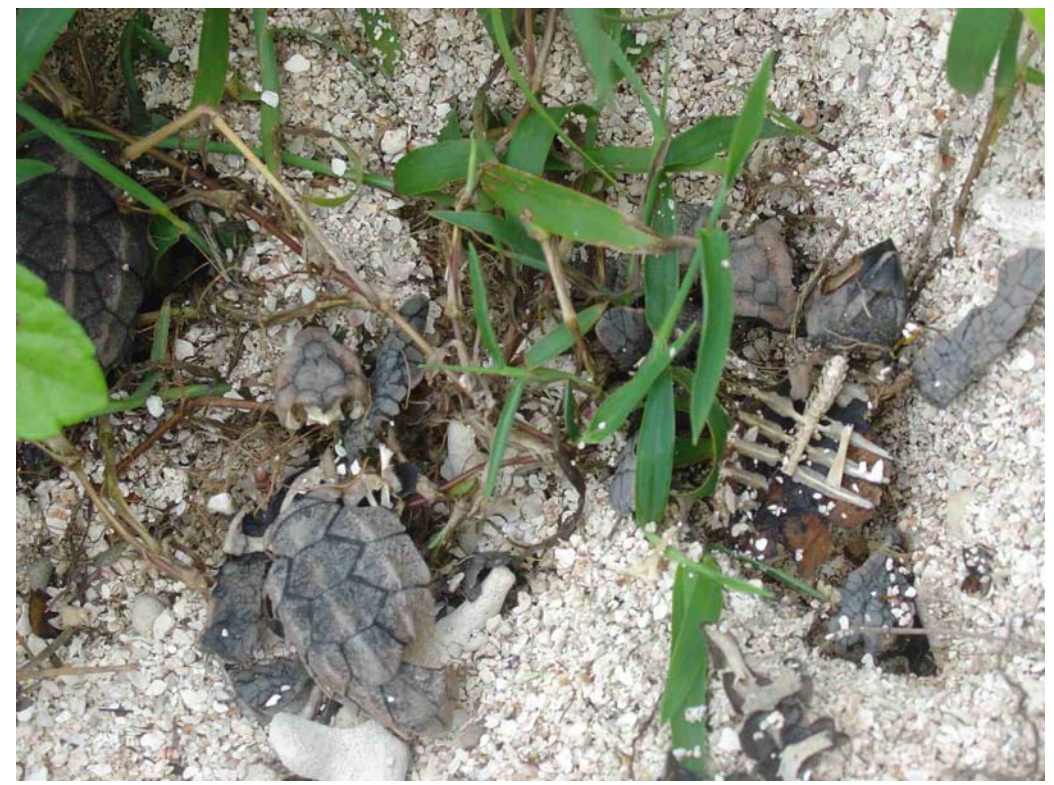
Photo 4. Dead hatchlings trapped in grass roots at top of nest.