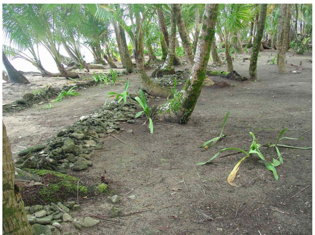
Photo 2. Ground cover vegetation of the upper beach platform was removed where hawksbills nest on Water Cay, Pearl Cays, Nicaragua.