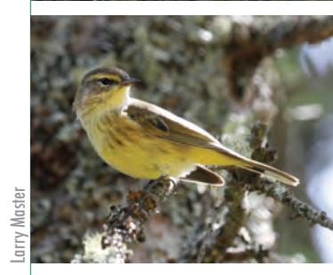
Photo far left: A "charismatic mega-bog"; an island of boreal biodiversity nestled in a temperate northern landscape. Above (top to bottom): rusty blackbird; gray jay; palm warbler.