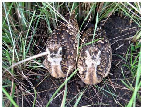
Two chicks of Critically Endangered Bengal Florican spotted in Kampong Thom Province.

The Bengal Florican ( Houbaropsis bengalensis ) is listed on the IUCN Red List as Critically Endangered, and has a global population of fewer than 800 individuals. Cambodia is the most important country worldwide for Bengal Florican conservation with an estimated 432 individuals nationwide in 2012. The grassland of the Tonle Sap floodplain in Kampong Thom Province is home to the largest population of the birds in the world and is critical to their survival. Bengal Floricans typically have either one or two chicks each year, these birds come from one nest. Read Khmer