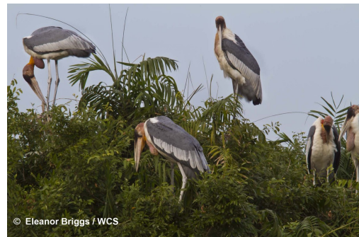
Globally Endangered Greater Adjutants in Prek Toal Ramsar Site.

Endangered Greater Adjutant chicks have successfully fledged from 175 nests in the Prek Toal Ramsar Site in Cambodia and disbursed across the country. The nests were protected for six months by conservationists from Cambodia’s Ministry of Environment (MoE), Prek Toal village, and the Wildlife Conservation Society (WCS).