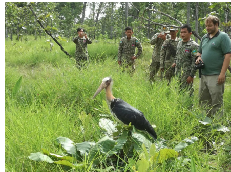
Globally Vulnerable Lesser Adjutant was released to the wild in Kulen Promtep Wildlife Sanctuary.

Angkor Centre for Conservation of Biodiversity (ACCB) in collaboration with the Ministry of Environment and the WCS released a threatened Lesser Adjutant back to the wild in Kulen Promtep Wildlife Sanctuary, Preah Vihear Province after this Adjutant had been rehabilitated at ACCB for more than a year.