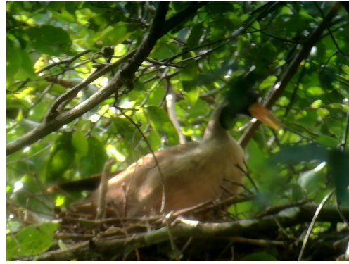
Globally Endangered Masked Finfoot on the nest in Kulen Promtep Wildlife Sanctuary.

Conservationists from the Ministry of Environment (MoE), WCS and local communities found the first Globally Endangered Masked Finfoot nest for four years on the Memay River in the Kulen Promtep Wildlife Sanctuary (KPWS) in Preah Vihear Province. This site is the only confirmed breeding location in Cambodia for this very rare species.