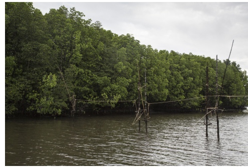
Sre Ambel river system supports Critically Endangered Royal Turtles and Siamese Crocodiles.

Sre Ambel River system is a very important conservation site because it is the only place in Cambodia where Royal Turtles, the Cambodia's national reptile, can be found. Read full story