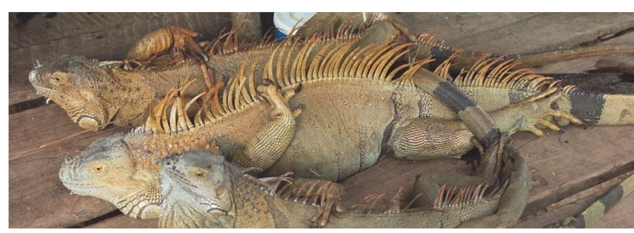
Kuwinda Nyama-a hunting game for social learning

It is possible that participants criticize certain aspects of the game, such as the fact that there is only one species of animal and they only produce 1 offspring each year.