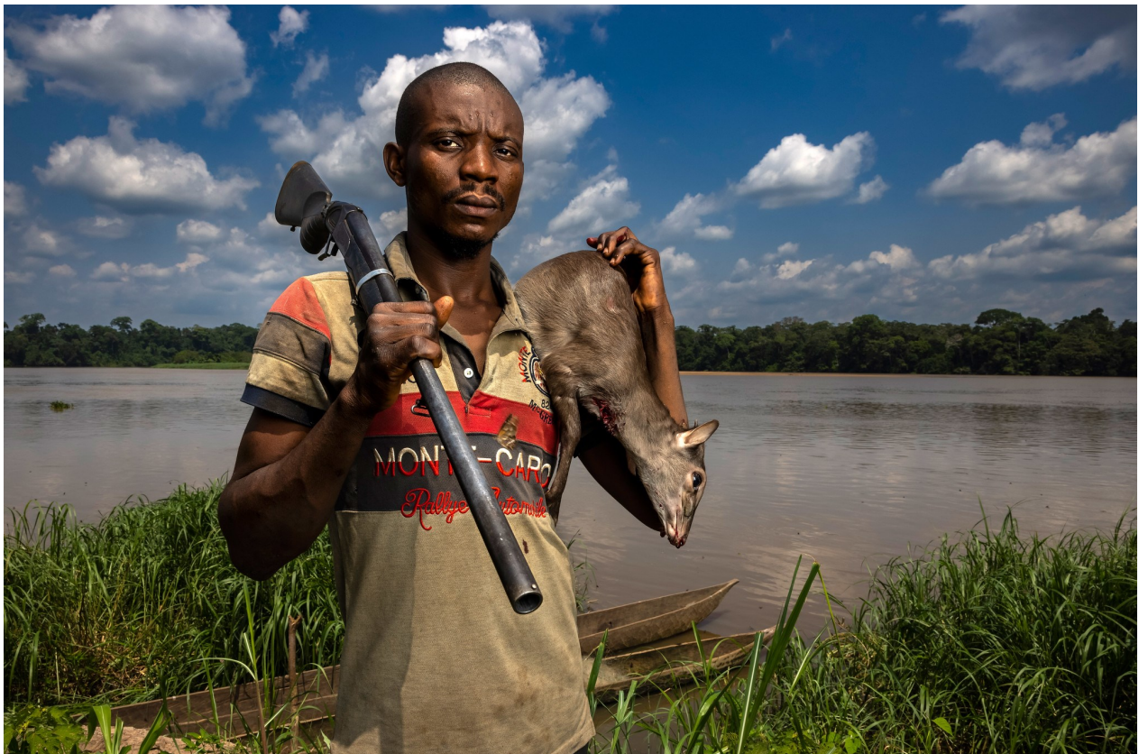
Wildlife Conservation Society