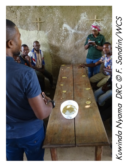
Wildlife Conservation Society

Playing the game in a public space with others from the community looking on extends the number of people who can learn about the consequences of player decisions on where, how often and how much to hunt. The ongoing conversation during the game encouraged players and observers to talk out loud about which decisions resulted