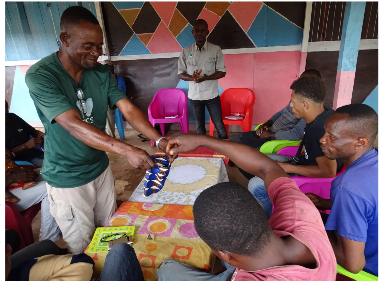
Kuwinda Nyama-a hunting game for social learning

At the end of each round the Game Manager tells the players that the Bean Counter will take the game bag to the other table where some additional animals will be added to the bag because animals reproduce.