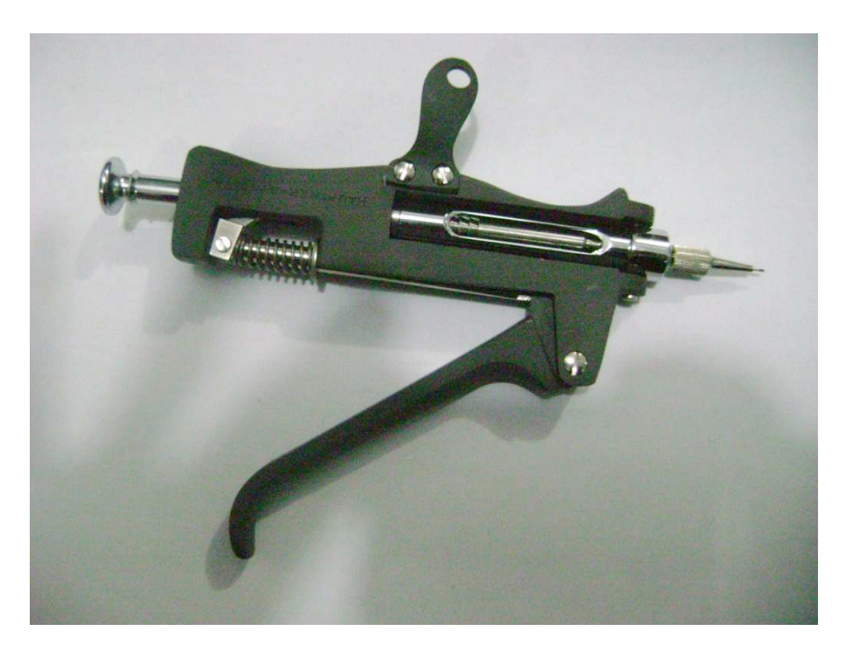
Plate 2: The model of tuberculin skin test injector used to test cattle in Wakhan in October 2010, here shown without the cartridge.